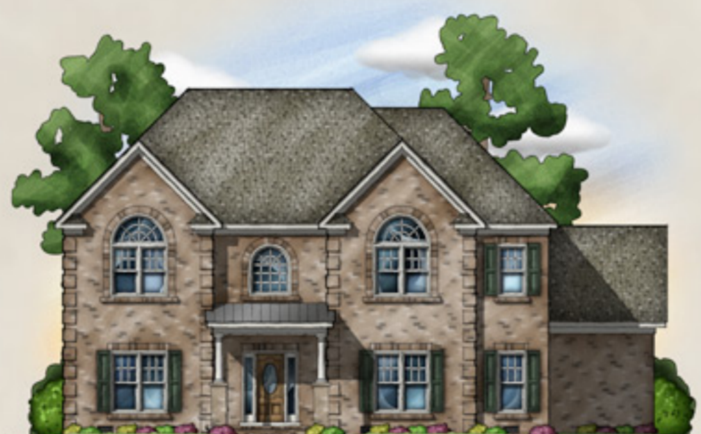
Elevation B - Side Entry