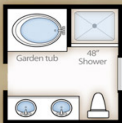
Optional Owner's bath