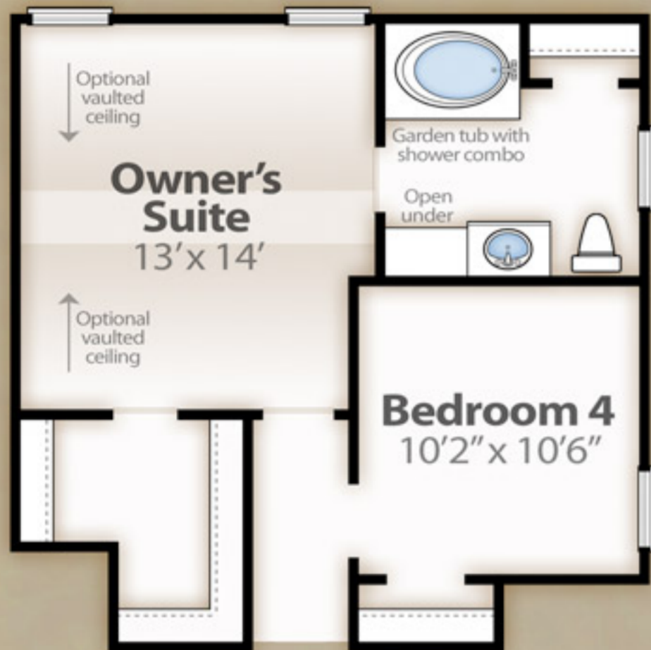
Optional Bedroom In place of sitting area